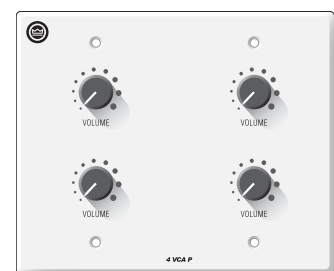
Optional 4-VCAP wall-mount level control module